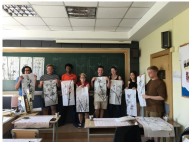
Students at Harbin Institute of Technology