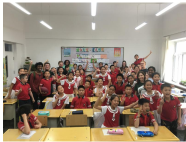
Students at Jihong Elementary School