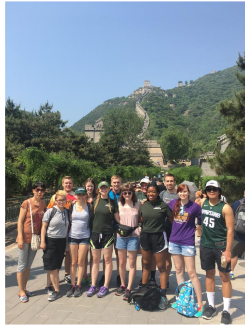
Students visited the Great Wall Beijing